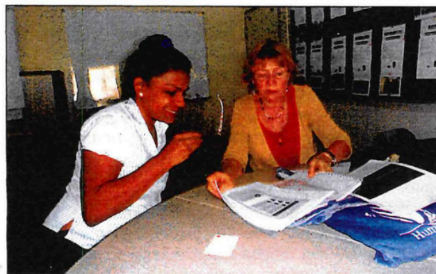
The President-Founder showing JamboMama! to the senior midwife of a big hospital in Tanzania.

Not ready to join? Gifts to SAHFA without a member commitment are also welcome.